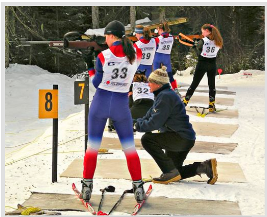
A blast from the past: Telemark – 2005